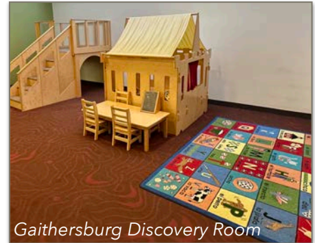
Gaithersburg Discovery Room

Have you taken advantage of the wonderful - and free! - playrooms available at select local libraries? They are filled with puzzles, games and toys to spark kids' imagination and encourage them to get into the habit of visiting the library. Reserve online (select one of the three) for some fun family bonding time, or bring friends and make it a playdate! The following locations near Tower Oaks feature Discovery Rooms: Gaithersburg Library (9 miles), Quince Orchard Library (9 miles), Germantown Library (12 miles)